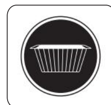
2 Removable Wire Storage Baskets